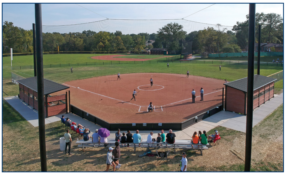
The Mehlville High School ballfields received new dugouts, netting, fencing and sprinklers and were relocated due to a storm drain that created a safety hazard in the outfield.