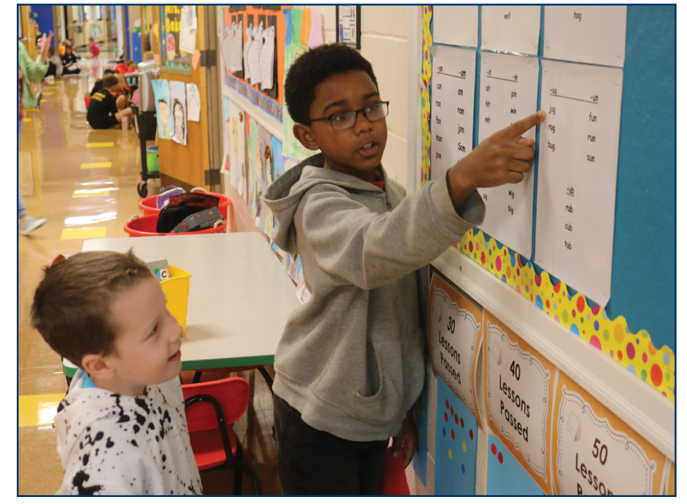
Buddies practice saying words with similar endings like "jug," "rug" and "bug."

able to teach kids context clues or how to retell a story, you know as a teacher that they can do those skills proficiently themselves."