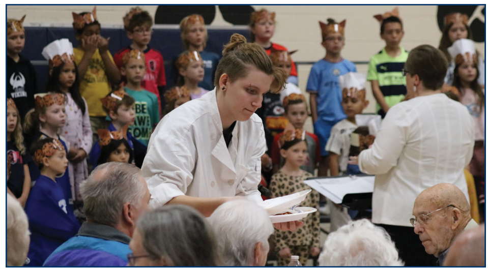
60plus members luncheon at Oakville Elementary

ur teachers and students are off to a terrific start this school year, and I couldn't be happier to be part of Mehlville School District. This year, I've started a new habit of sending a note to all of our staff highlighting the terrific things I see each week. It's aptly called "What I Saw This Week."