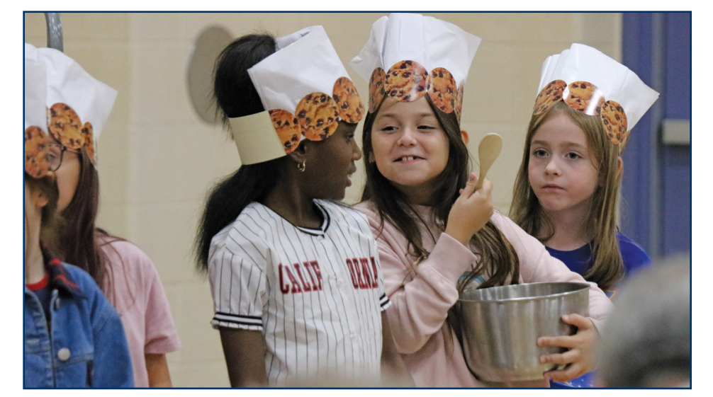
Second-graders at Oakville Elementary School performed cookie-themed songs for our 60plus members.