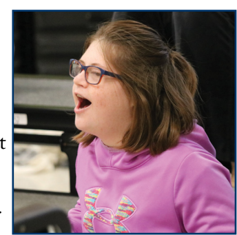
beginning choir performance

I saw our support staff work through unbearable conditions during a historic heat wave at the start of the school year. I saw our drivers return to the garage absolutely dripping in sweat each day, knowing that all the students on their bus were safely transported home. I saw the work that grounds crew, maintenance and facilities did, and it was far beyond any reasonable job description. The heat and humidity they fought to ensure our buildings were as cool as possible – despite aging Oakville High School's equipment - was superhuman.