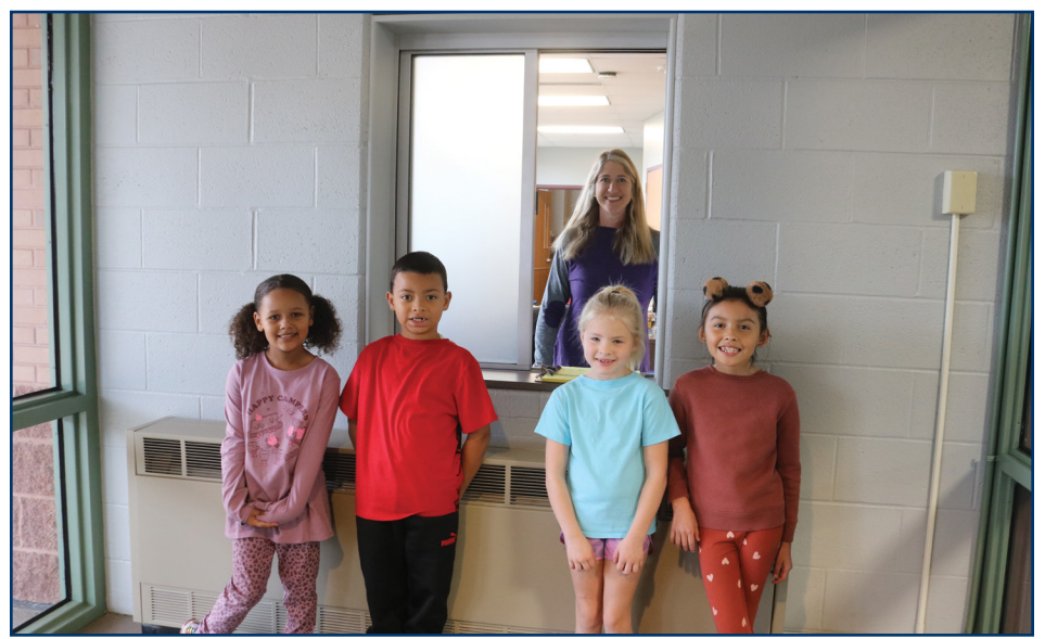
Completed Prop S improvements at Hagemann Elementary School include a security entrance and better access to the school's playground.

Work on Prop S projects will continue through 2025.