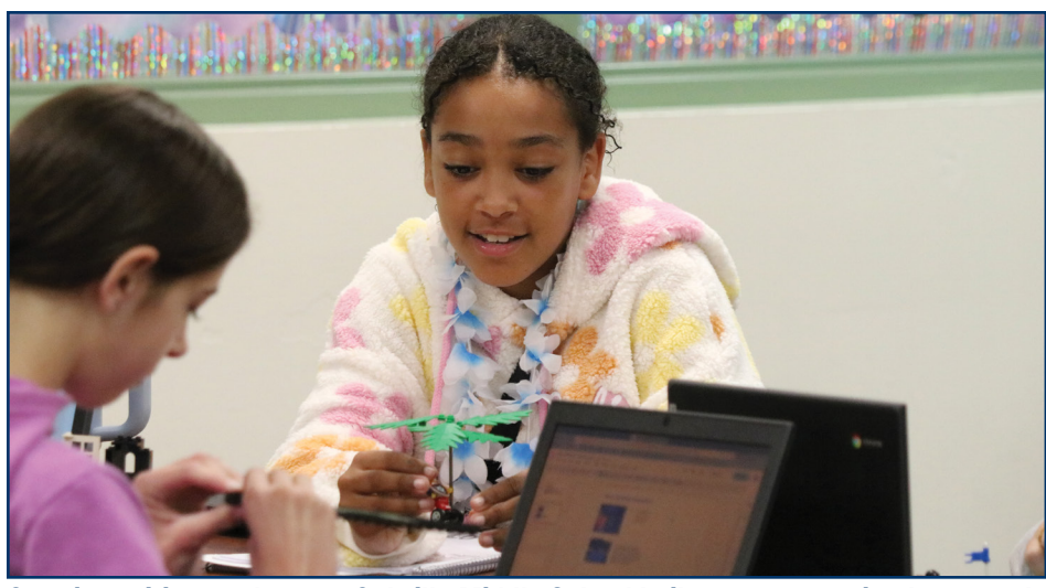
Creative writing students at Oakville Middle School built structures using Legos and wrote step-by-step instructions for how someone else could recreate the structure. A student in another class followed their directions and provided feedback on the quality of their writing.