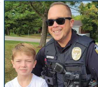
Blades Elementary 9/11 remembrance ceremony

I saw active math in an activity called Solving the Savanna. Second-graders at Hagemann Elementary School worked their way around the room to find the missing number that when combined with the given number equaled the sum. Each math problem had an animal from the