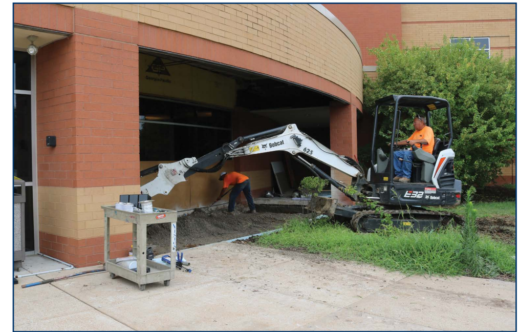
Crews dug trenches at Bernard Middle to pour concrete for the school's new security entrance.