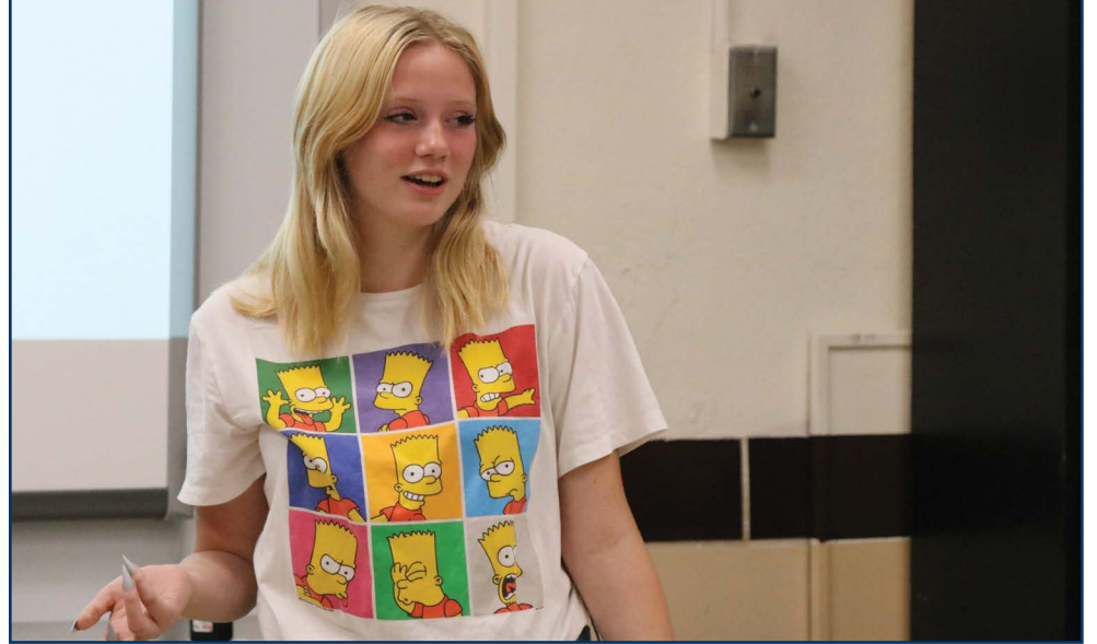
Delivering speeches: High school students used Mehlville Summer Session as an opportunity to recover credits and take electives to free up room in their schedules during the school year. This student delivered a persuasive speech about why people should not use dating apps.