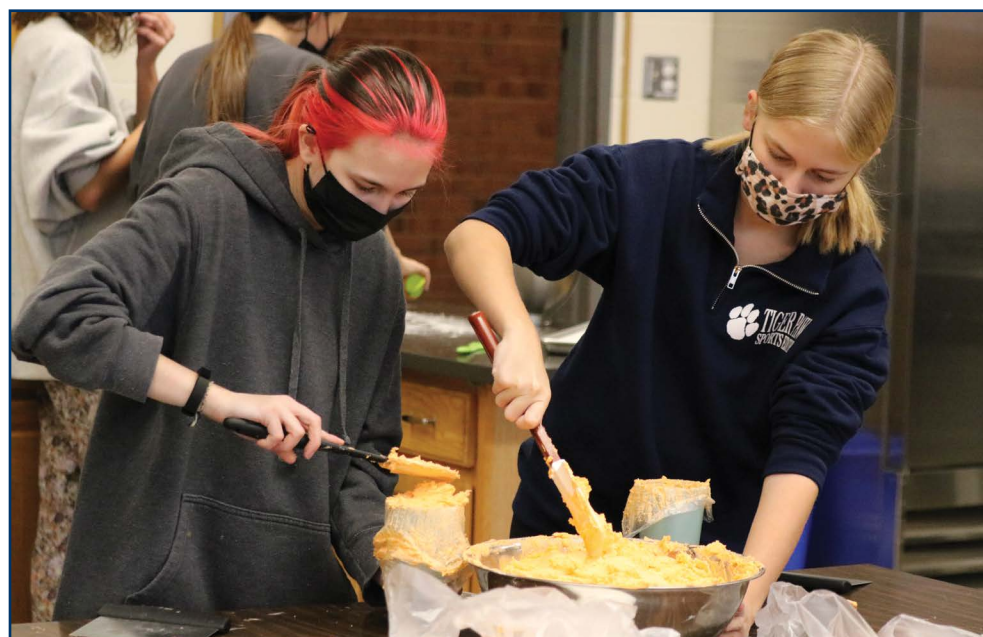
Students in Oakville High School's Soup Kitchen Club made meals and treats to share with others in our community last year.