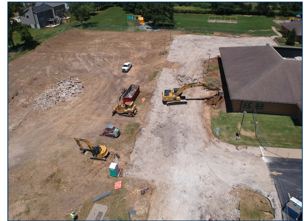
The Oakville Elementary parking lot is being expanded to improve student safety and reduce traffic congestion on Milburn and Yaeger roads.

Roof work at Washington Middle was completed using funds from Prop A and Prop S. Roofing projects at John Cary Early Childhood, Beasley Elementary, Trautwein Elementary, Wohlwend Elementary and Mehlville High were completed using Prop A.