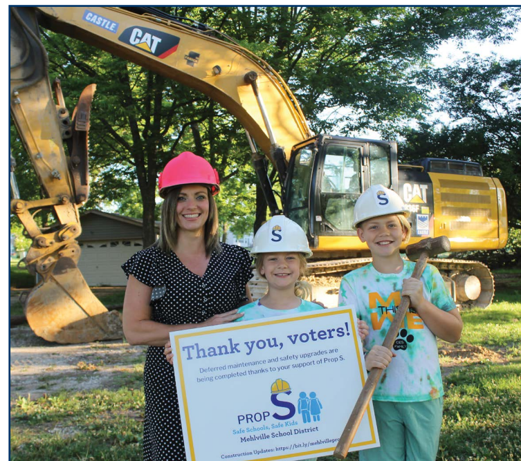
Thank you, voters! Students at Oakville Elementary celebrate progress on a bigger, safer parking lot. Demolition crews made way for the improvements in June. Learn more about construction projects on page 6.

The Board of Education wishes all our students, staff and volunteers much success and happiness this school year!