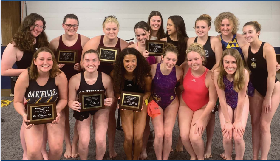
Oakville High School girls water polo team