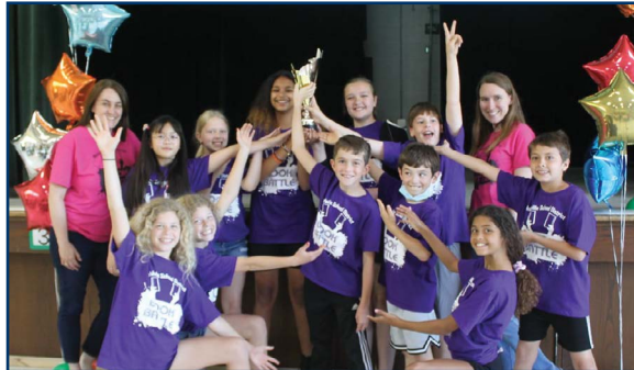
Hagemann Elementary Book Battle Team