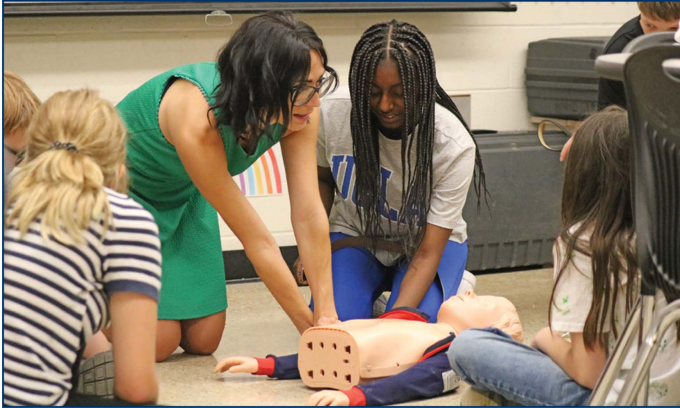
Life-saving skills: Some middle school students at Buerkle Middle School learn life-saving skills, including administering CPR and applying tourniquets.

Elementary, middle and high school students were busy learning this summer at Mehlville Summer Session! Kindergarten through eighth-grade students had the opportunity to participate in enrichment activities that reinforce the curriculum, while high school students worked to recover credits and free up room in their schedules by taking electives like speech, art, health and more! Check out some sights from around Mehlville Summer Session.