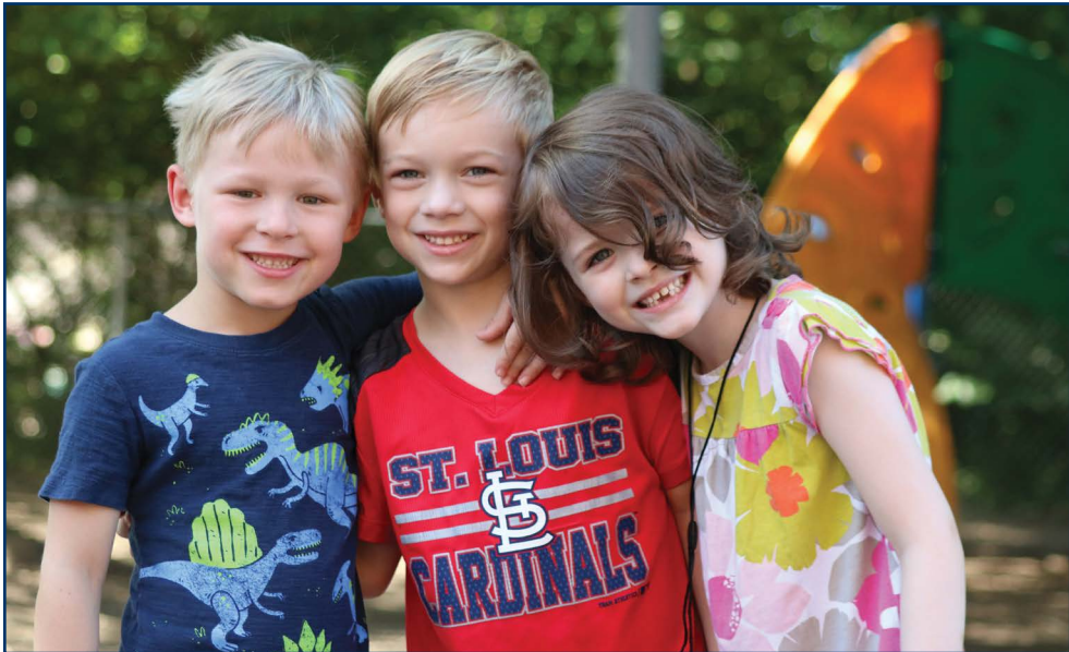
Fun in the sun: Students had the opportunity to learn in the classroom and play with their friends on the playground.