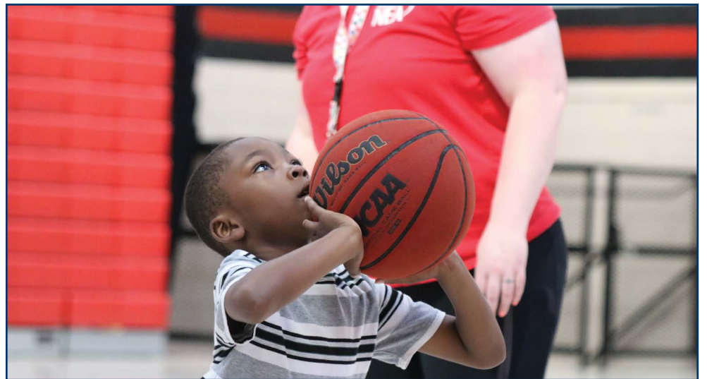
Shooting hoops: In addition to traditional subjects like reading and math, students also learned art, physical education and music.