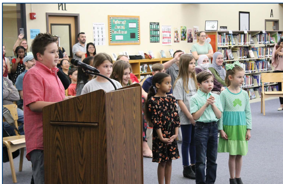
Members of the Rogers Elementary Sunshine Club share their accomplishments at a Mehlville Board of Education meeting.

The decision on how to use relief funds was made by a group of dedicated teachers and administrators who met in spring 2021 to determine what learning recovery supports we would put in place for students.