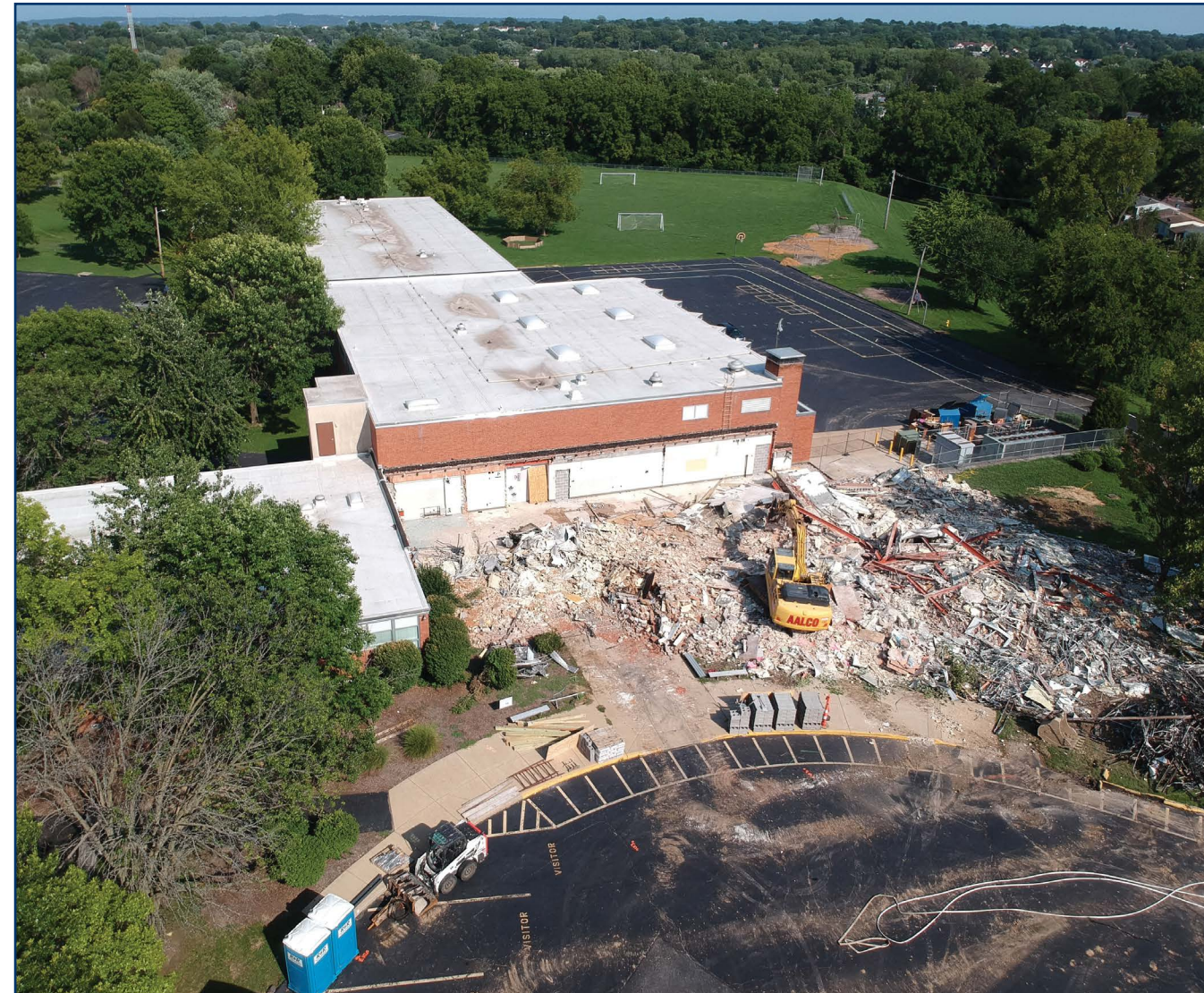
Crews demolished the entrance of Bierbaum Elementary to make way for a security entrance and accessible classrooms.

“Because there is such ongoing work with Prop S, we know that this will create some inconveniences for our families with different schools having projects completed at different times,” said Dr. Dickemper. “We want to thank everyone for their patience. This will be a positive for our schools, and the investment of time, patience and community resources is well worth it.”