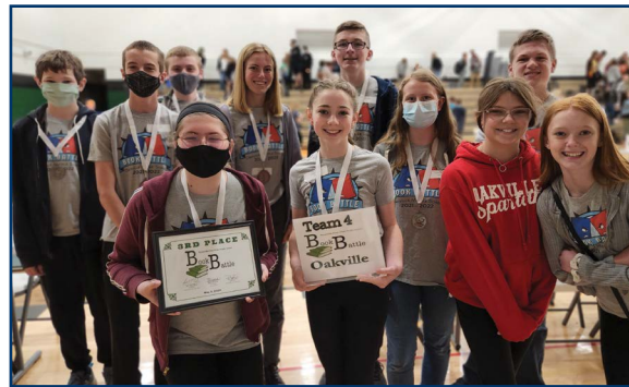
Oakville Middle Book Battle Team