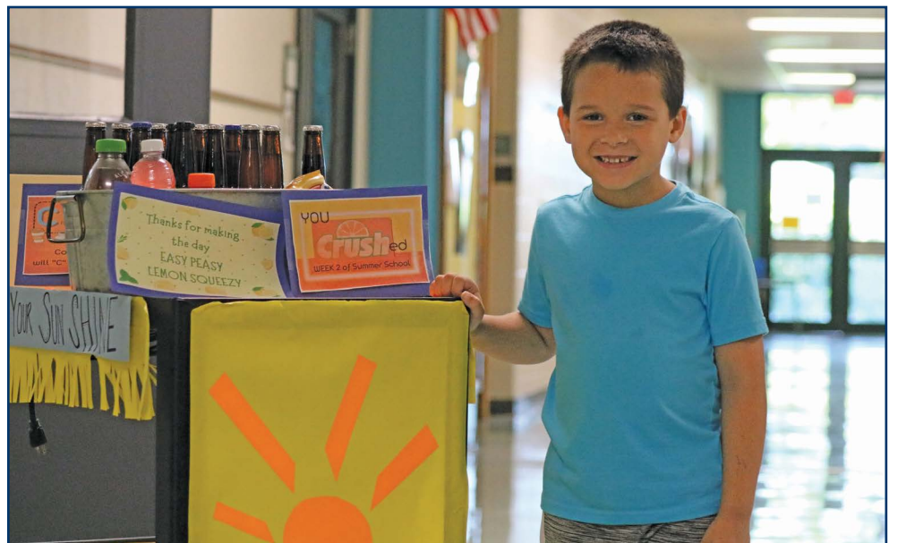
Spreading sunshine: Students at Forder Elementary helped spread smiles to their teachers by visiting their classroom with the Sunshine Cart, which contained goodies and treats for the staff.