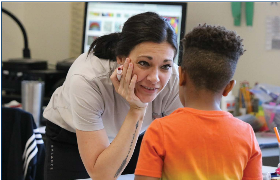
Caring teachers: Our staff worked throughout the summer to create unique learning opportunities for their students.