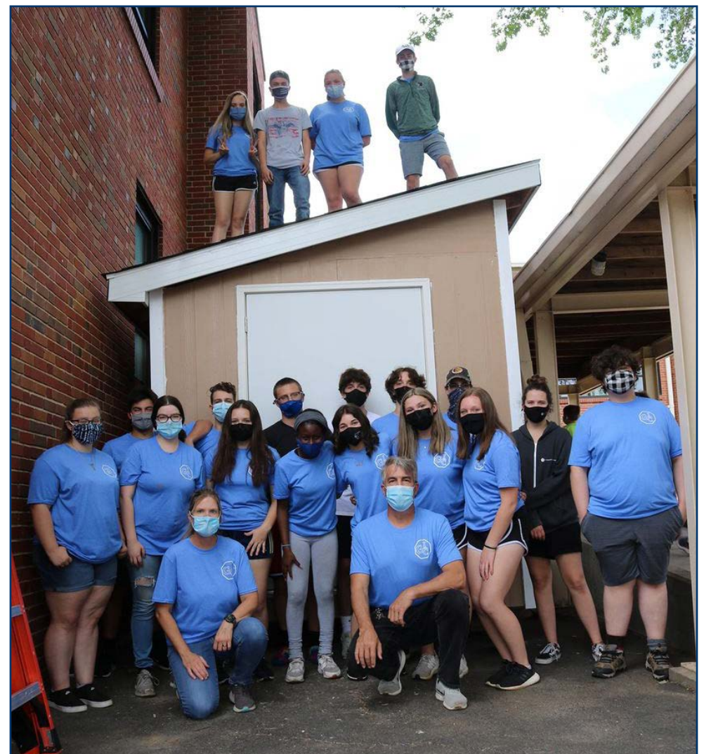
Above: Mehlville High School Geometry in Construction students with their completed shed at MOSAIC Elementary School.