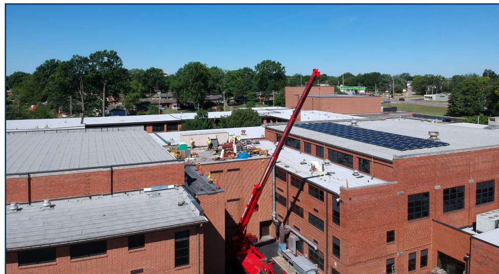
Crews replaced a portion of the roof at Mehlville High School this summer. See more facilities work on page 4.