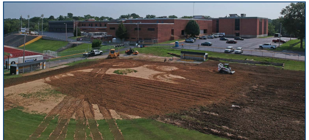
Crews are expected to complete extensive safety improvements to the Oakville High School baseball/softball field near the end of October.

The project is being paid for using funds generated by Prop S. The baseball/softball fields at Mehlville High School are scheduled for similar safety upgrades through Prop S. That project is a larger project since the baseball field will be relocated due to a storm drain in the outfield. Due to the high price of construction materials, there are plans to rebid that project for next summer.